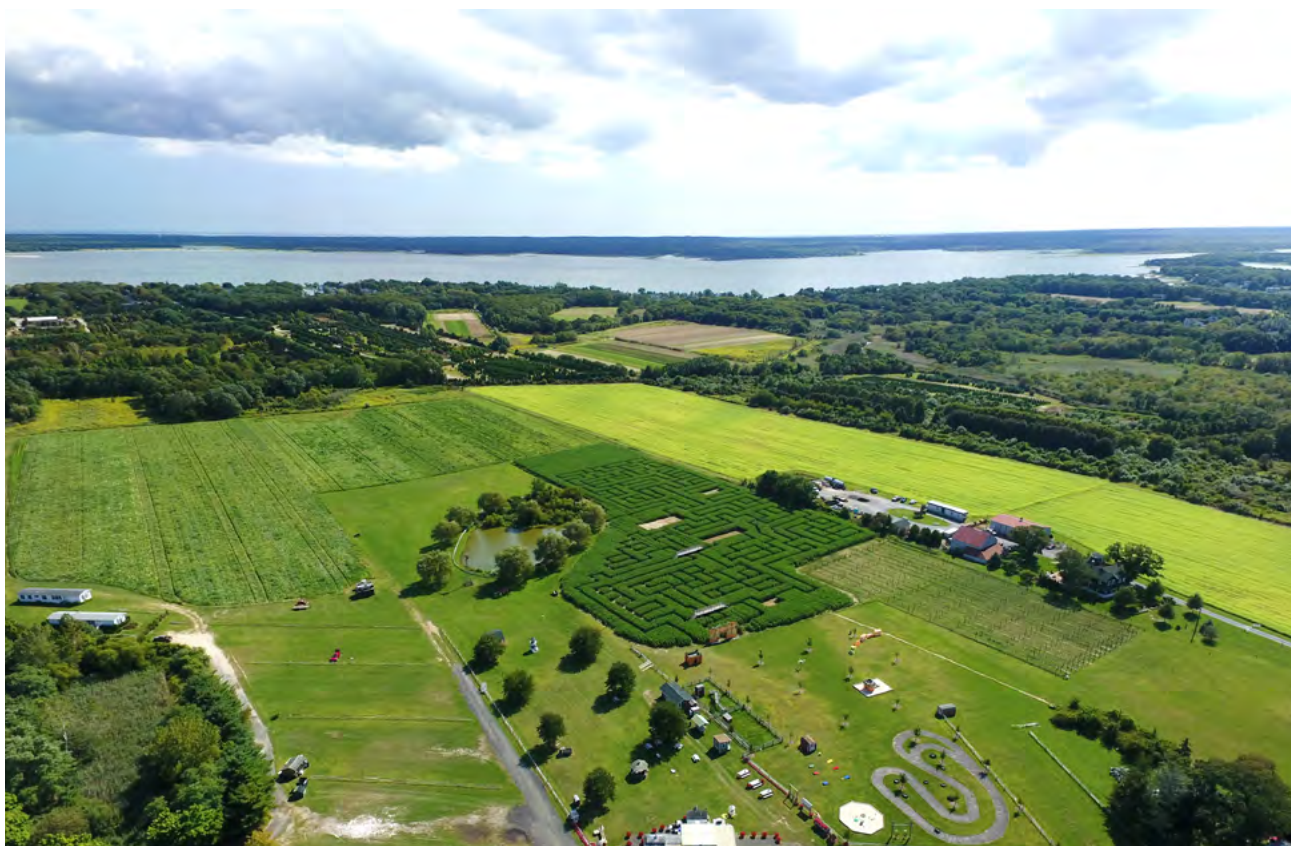
An aerial view of the PumpkinLand Corn Maze at Harbes Family Farm in Jamesport, NY.