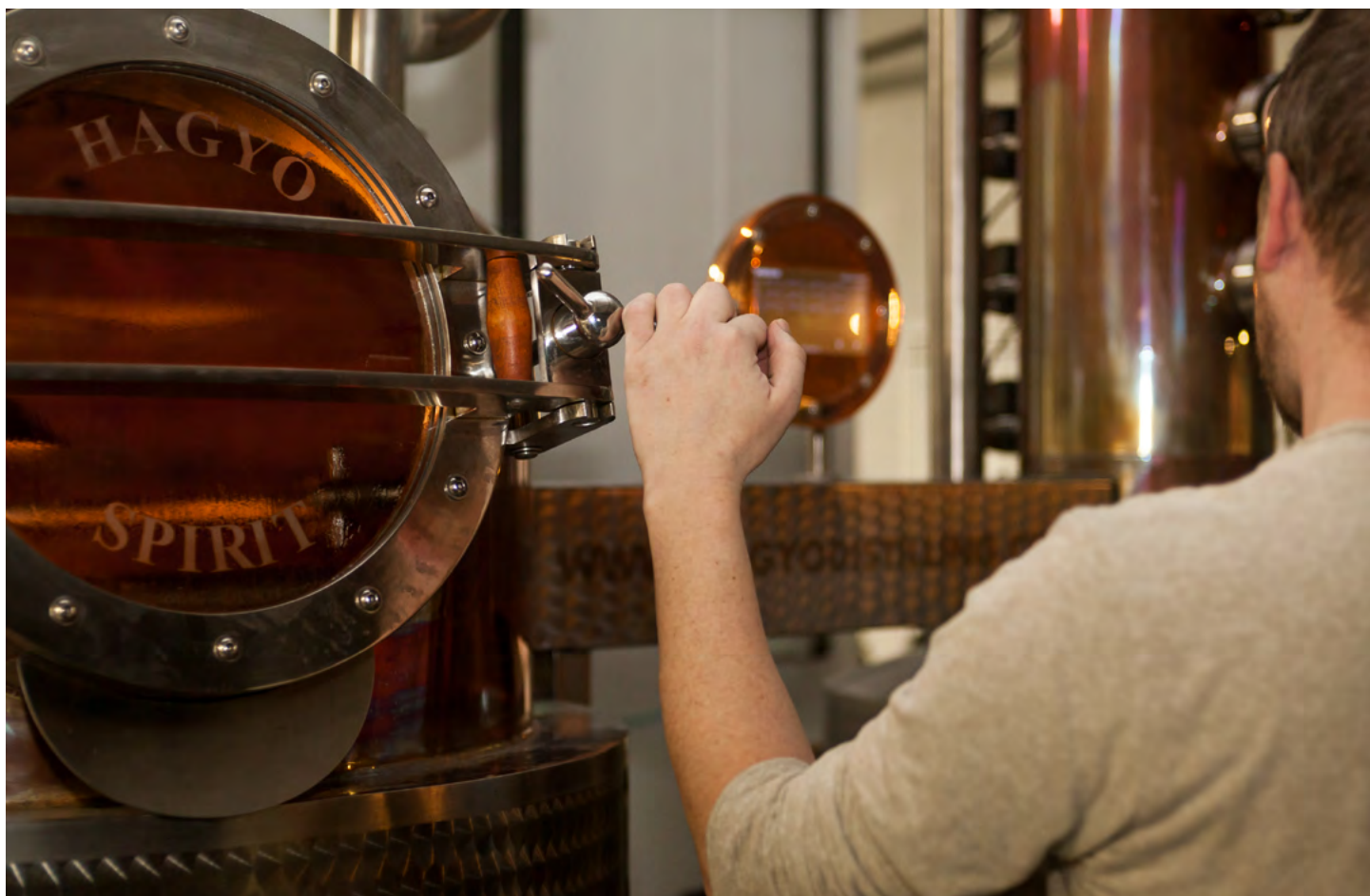
A view from inside Boardroom Spirits' sustainable micro-distillery in Lansdale, PA.

Boardroom vodka, gin, and rum began turning heads soon after the company's sustainable micro-distillery opened its doors in early 2016. They're the favorites of purists and mixologists alike, with both camps appreciating the clean taste that results from Boardroom's pure and simple distilling process.