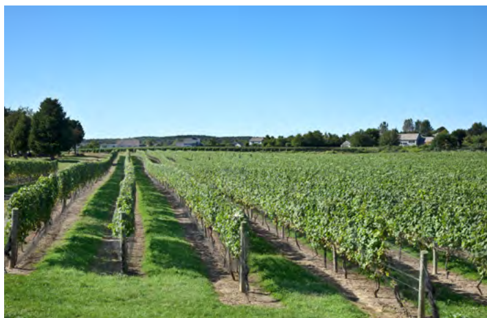
Above: a striped bass special at La Plage in Wading River. Top right: Setauket celebrates Culper Spy Ring Day. Bottom right: Long Island wine country; there are too many to pick from, so your best bet is to get on a tour bus.

cumstances; it's set on the edge of an empty field and looks ripped straight out of a horror movie. Add a sequence of sophisticated practical gags and some very committed actors and it's truly terrifying. Well worth the $25 admission; don't bring any kids under 10.