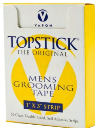
Topstick Men's Grooming Tape