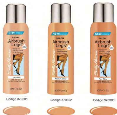
Sally Hansen Airbrush Legs