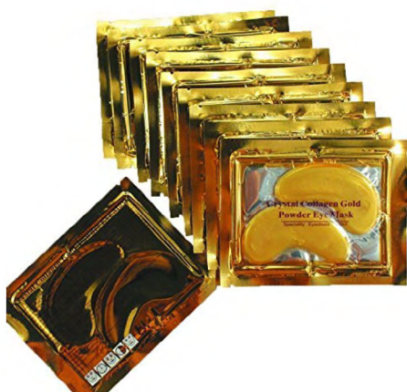
Crystal Collagen Eye Mask