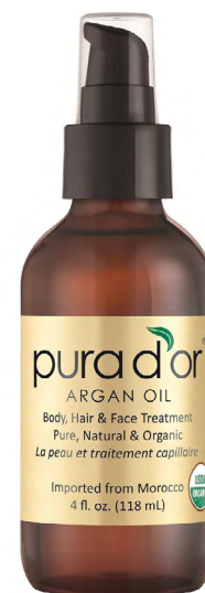
Purador Argan Oil