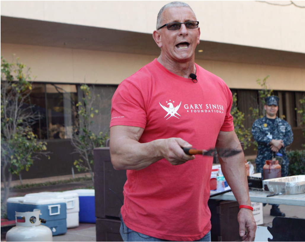
Robert flips burgers at one of the Invincible Spirit Festivals put on by the Gary Sinise Foundation. Robert is a fixture at the festivals, donating his time; the Robert Irvine Foundation provides monetary support.

In the 2016 fiscal year, the foundation raised $101,812 through corporate and individual donors, with a portion of this total being allotted by Robert Irvine Foods and Robert Irvine Products. The full 100% of the total donations received was distributed through the foundation's grants program.