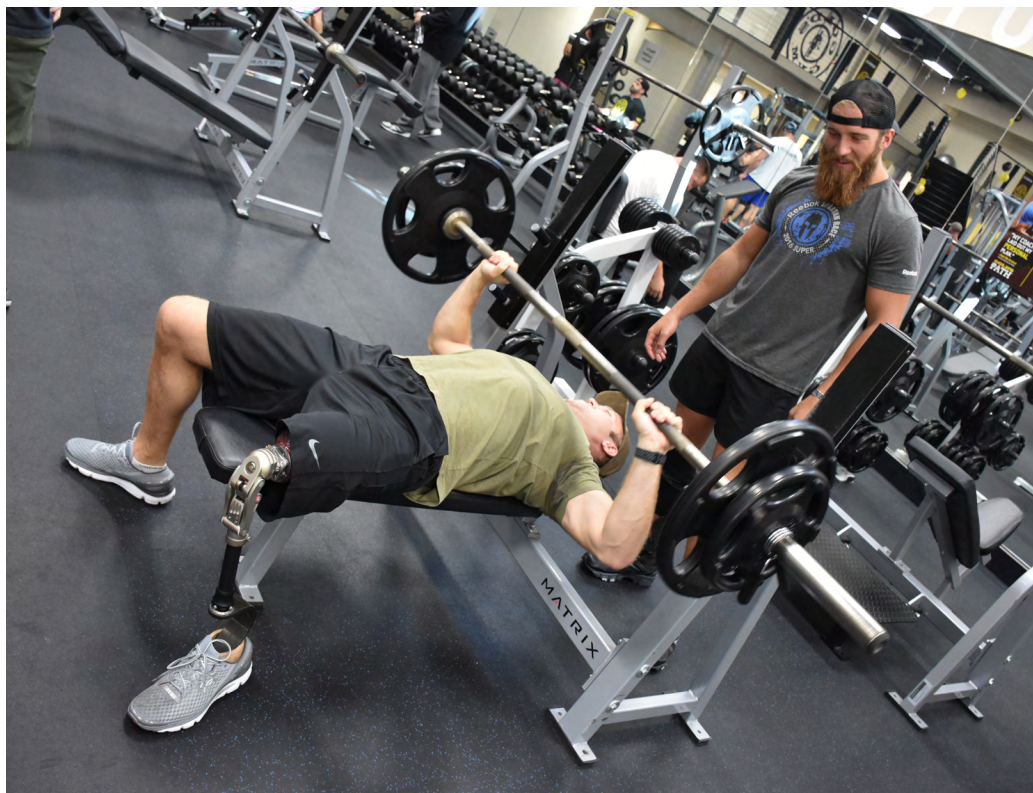
Above, veterans train during the grand opening. Below, an overview of the main floor of the facility.

To stay up to date on happenings at this location, follow the gym on Facebook.