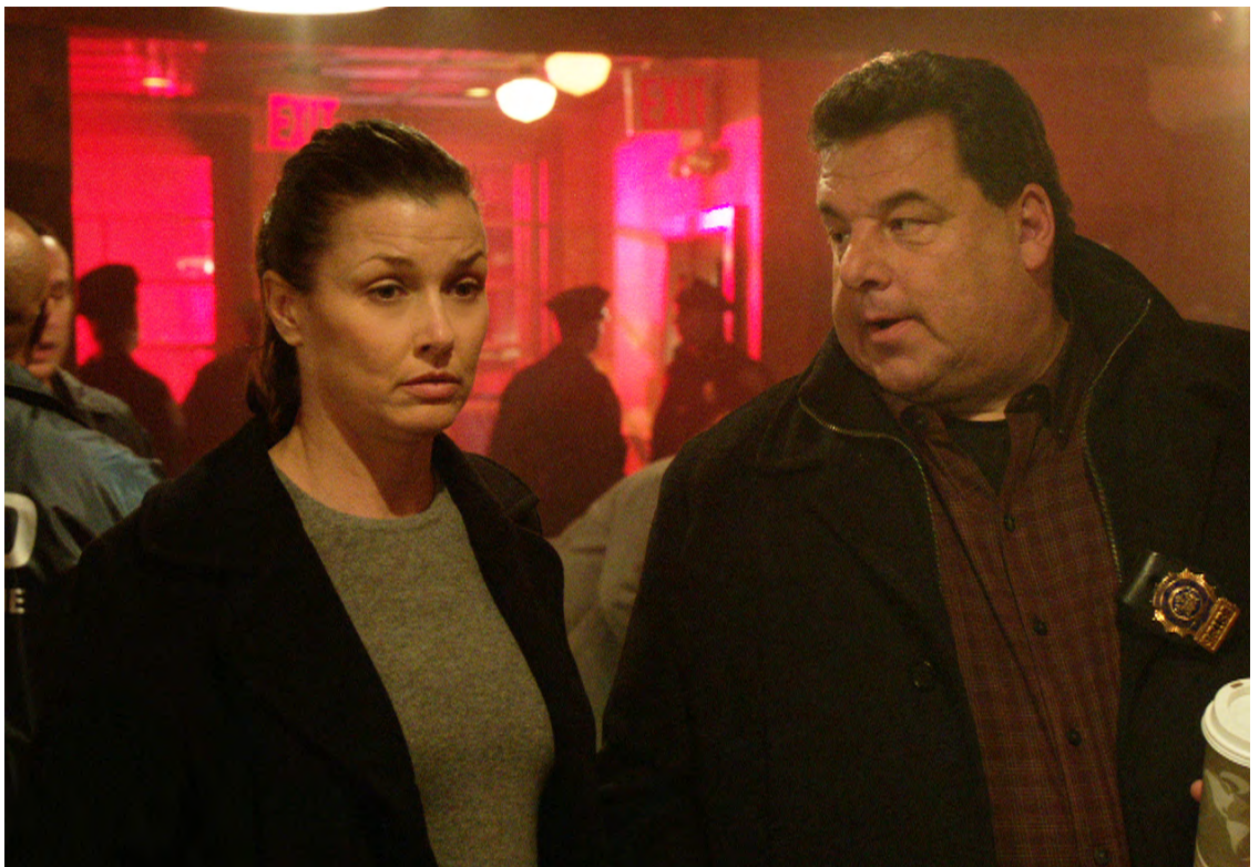
Schirripa stars in Blue Bloods on CBS, airing Fridays at 10/9 c. You can stream episodes online HERE . You can follow Schirripa on Twitter HERE .

SS: It's a diet of good living, that's what that was. It's not a "diet" book. It was a tongue in cheek, the "Goomba Diet". I just lost twenty pounds by eating the fish the way I just described, but it's not a diet book. (Laughs)