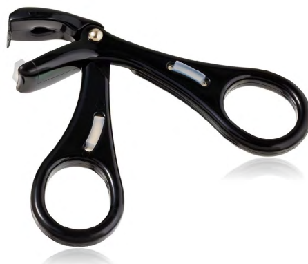
Japonesque Lash Curler