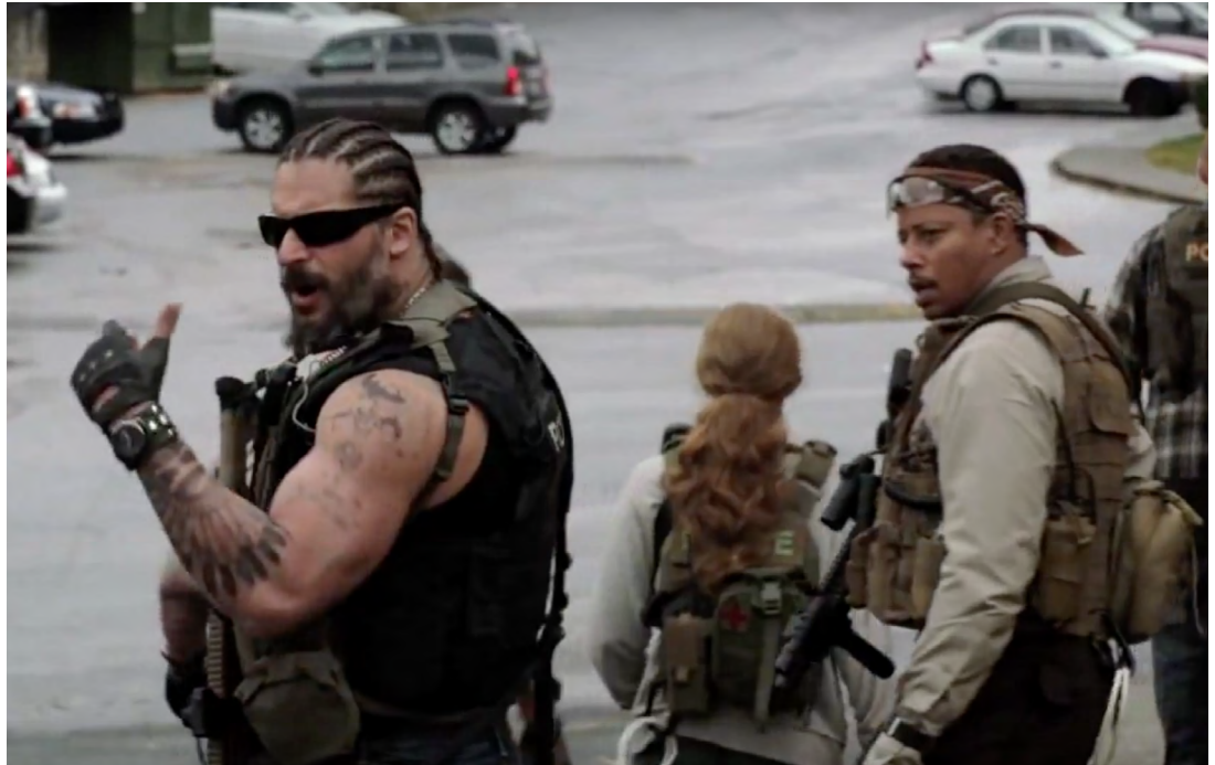
Above, Joe Manganiello played a rough and tumble DEA agent in 2014's Sabotage alongside Terrance Howard and Arnold Schwarzenegger. Below, the screen test released last year for Deathstroke , the main villain that Manganiello will play in the upcoming solo Batman movie.