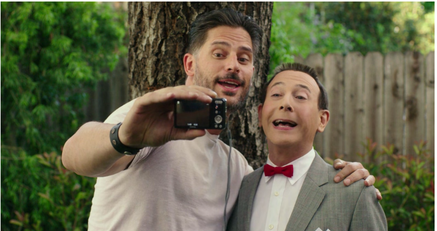
Smurfs isn't Manganiello's first turn toward family-friendly fare. In 2015 he co-starred with Paul Reubens in Pee-wee's Big Holiday for Netflix.