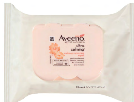
Aveeno Ultra-Calming Wipes