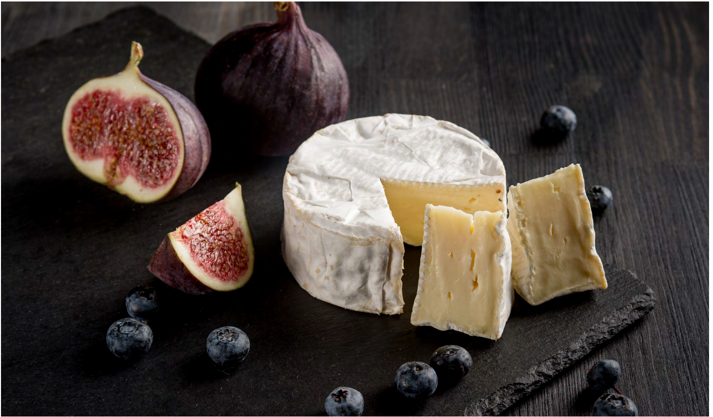
FIG & BRIE BRULEE, BRANDIED CHERRY

This month, transform ordinary ingredients into extraordinary food in just a few simple steps.