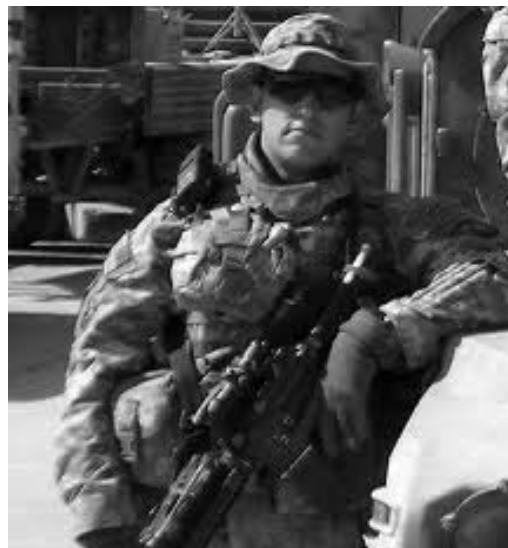
Schlitz, ready to go out on patrol during the height of the Iraq war surge.

Two-and-a-half hours into the mission, Schlitz's convoy had just finished clearing a dead end street. The convoy slowly made its about-face, with Schlitz riding in the Humvee bringing up the rear. Un-