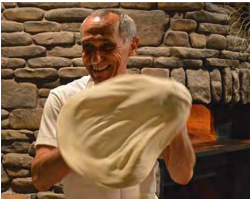
The joy of cooking is back on the menu at Saporì D'Italia.