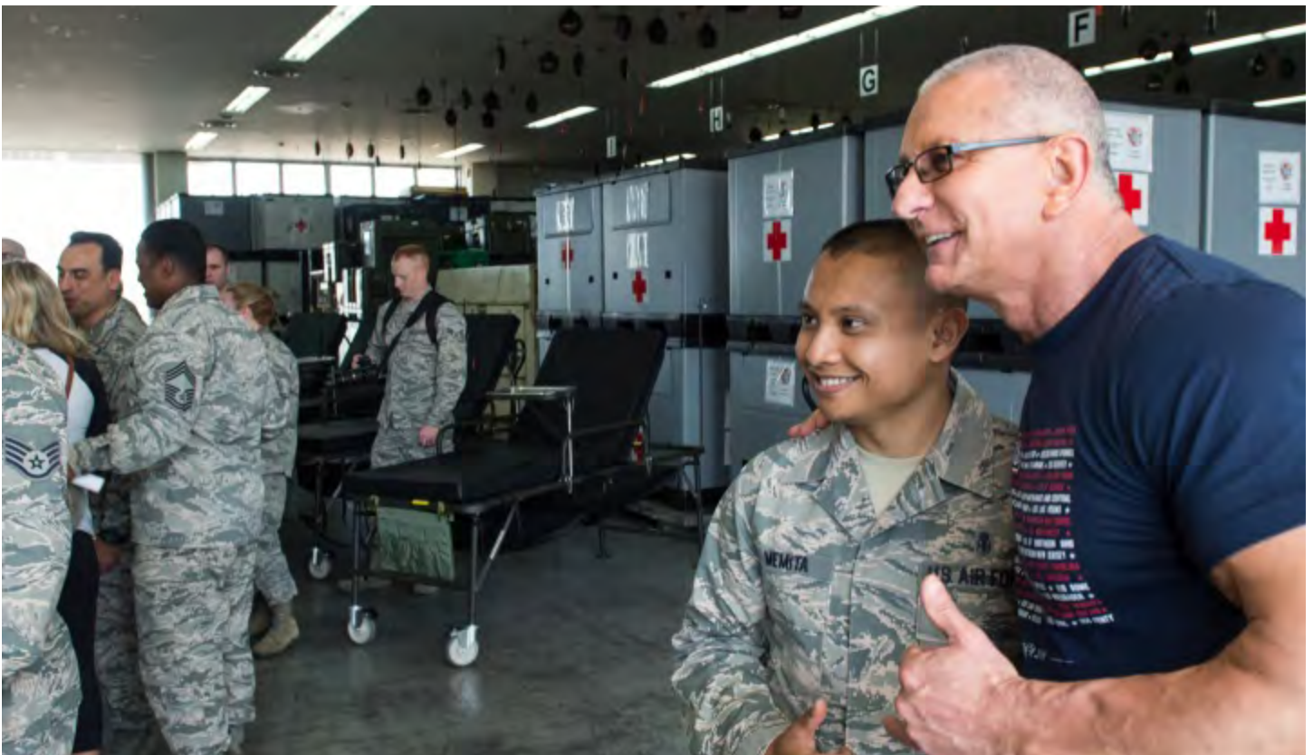
Celebrity Chef Robert Irvine poses for a photo with a member of the 374th Medical Support Squadron at Yokota Air Base.