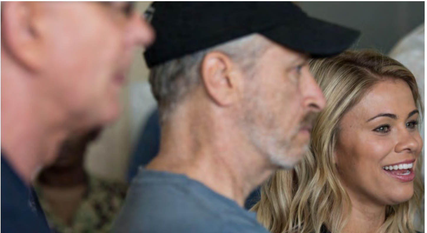
Professional fighter Paige VanZant watches as members of the 374th Medical Support Squadron display how they receive and stage wounded warriors for Entertainers visiting Yokota Air Base, Japan.