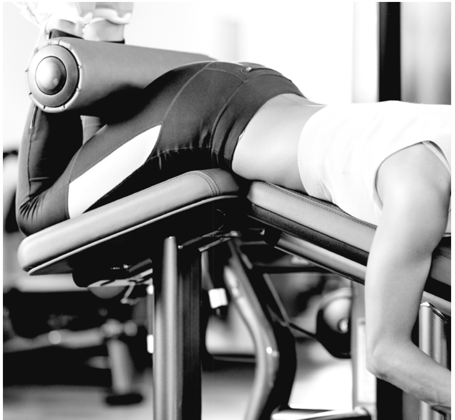
Above: a machine leg curl. Below: a machine leg extension. Hit these machines back-to-back without rest and keep moving. Both moves are excellent active recovery.