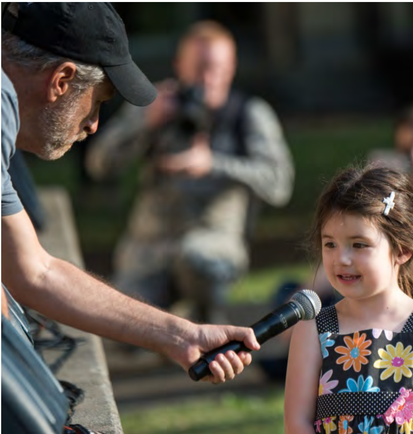
Jon Stewart asks some questions from a child during a USO variety show at Yokota Air Base, Japan; the first stop on the annual Vice Chairman's USO Tour, April 22, 2018.