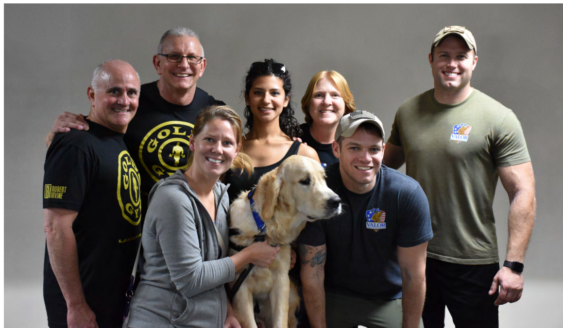
The Valor Service Dog team and the Robert Irvine Foundation huddle up with Huey, who will eventually make his way to the home of a veteran in need.

To support Valor Service Dogs and learn more about their mission, visit: www.valorservicedogs.org .