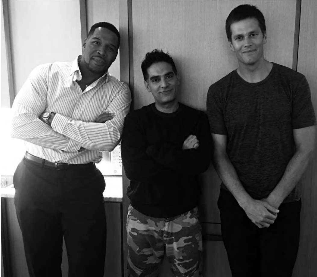
Gotham Chopra, flanked by NFL legends Michael Strahan and Tom Brady, who serve as Executive Producers on Religion of Sports . “Every time we’re on a call together, Michael will definitely remind Tom about those two Super Bowls [that the Giants won],” Gotham says. Follow Gotham on Twitter and Instagram .

RI: Aside from you father, who in the field of spirituality do you admire? Do you read other people?