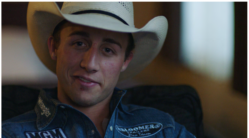
Episode Two tackles the Calgary Rodeo, where the last vestiges of the Old West fight to survive in a rapidly changing world.

RI: You've talked about how sports—not just the major professional sports on television—but that local sports in schools really bring us. Having played high school and college sports myself and then covering local sports for a daily newspaper, I also saw a great number of negatives with