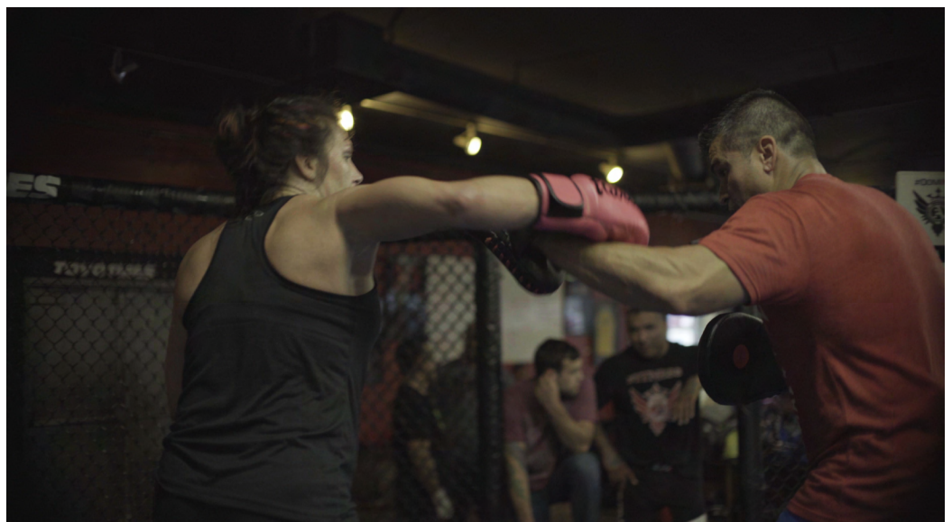
Episode Three of Religion of Sports follows female MMA star Cat Zingano on her comeback trail to UFC 200, her first fight after devastating personal and professional losses.