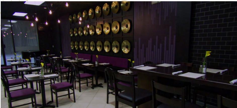
Top: Robert introduces Semone and Gigi to their new restaurant. Center: the old Gigi's Music Cafe. Bottom: The new layout adds a slick equalizer look on the wallpaper and several rows of speakers. The old graffiti is gone, so are the purple curtains and the chintzy VIP area.